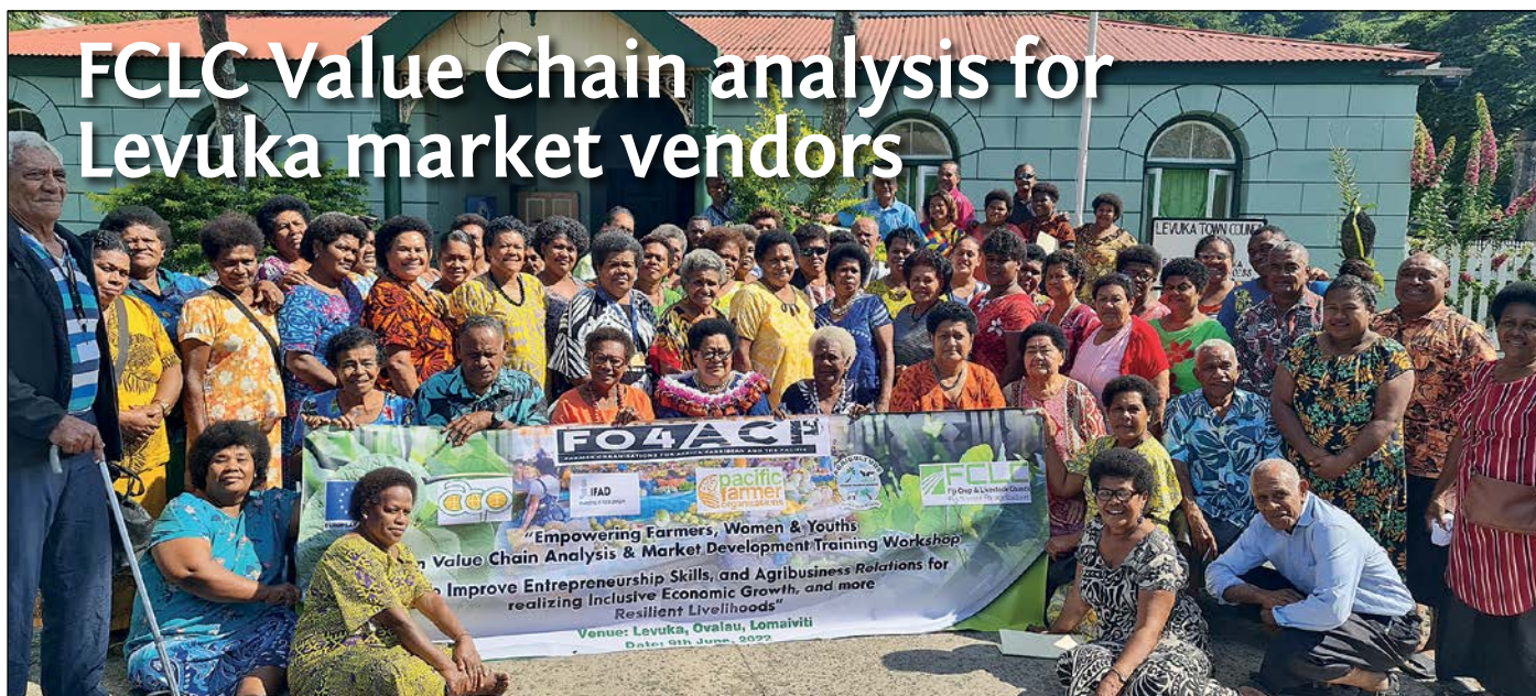
Ovalau and Moturiki market vendors and farmers gained valuable analytical tools at the workshop.

MORE than 60 farmers and market vendors from Ovalau and Moturiki have been introduced to value chain analysis at a two-day training workshop, facilitated by Fiji Crop & Livestock Council (FCLC) and held in Levuka, Ovalau. The workshop was officially opened by the Assistant Minister for iTaukei Affairs, Honourable Selai Adimaitoga.