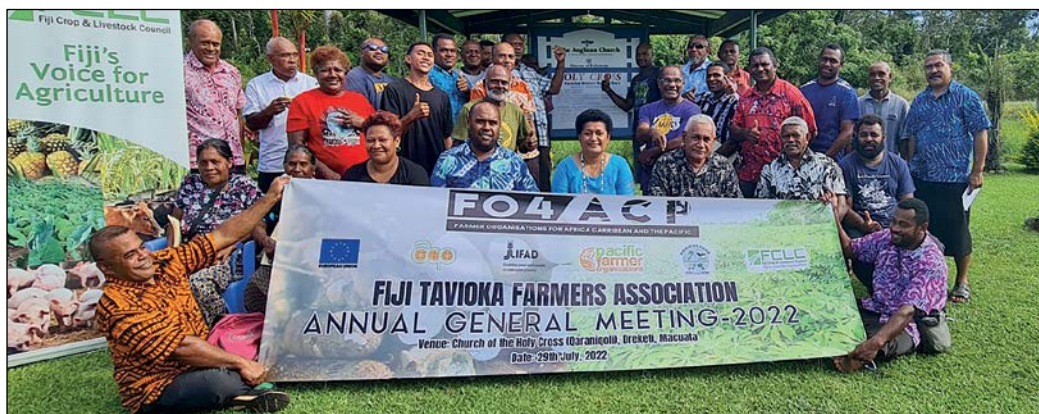
Fiji Tavioka Farmers Association members celebrate after their first AGM.