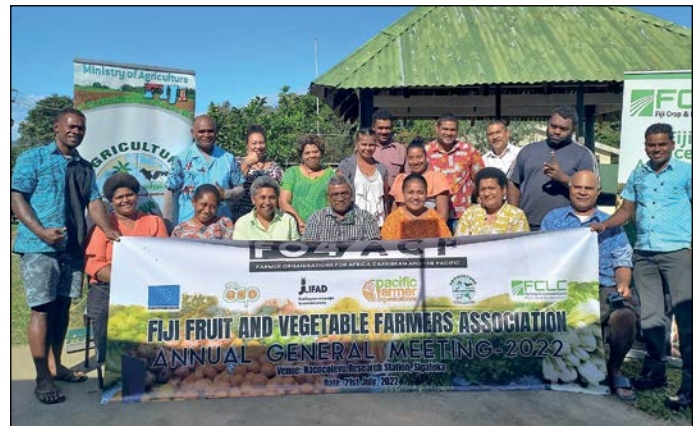
Fiji Fruit & Vegetable farmers gathered at Sigatoka for the AGM.

HELD 21st July at Nacocolevu Research Station, Sigatoka, the Fiji Fruit & Vegetable Farmers Association held its first Annual General Meeting, where the Association constitution was read and office holders were elected as follows: