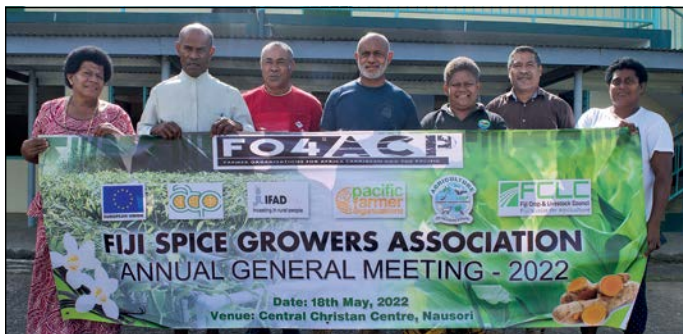
The Fiji Spice Growers Association was the first association to hold their AGM.

HELD 18th May at Central Christian Centre Hall, Nausori, the Fiji Spice Growers Association was the first FCLC farmer organisation to hold its first Annual General Meeting, where the Association constitution was read and office