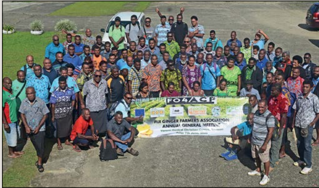
The Fiji Ginger Farmers Association AGM was well attended.