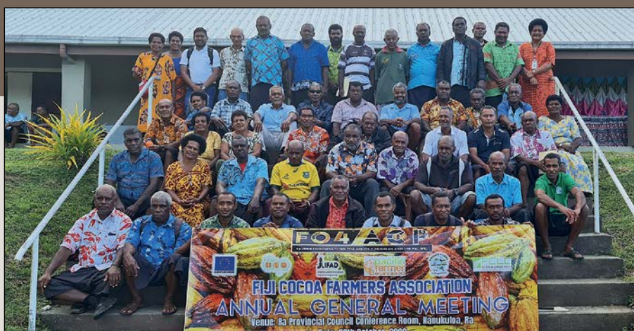
Fiji Cocoa Farmers Association members following their AGM in the Ra Provincial Council Room.