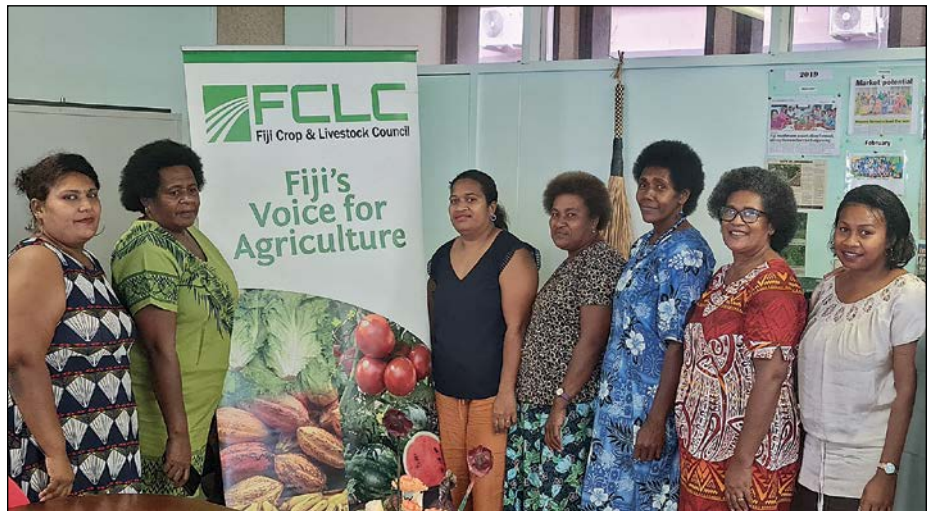
Women Dairy farmers register their Association at the FCLC office.

"FCLC welcomes all women Dairy farmers to become members of this umbrella organisation, and we commend the efforts