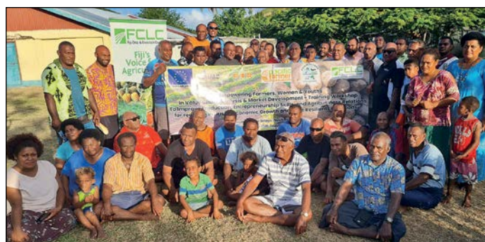
Value chains and Parametric Insurance awareness were on the agenda for Yasawa Uvi farmers.

The FCLC team also took the opportunity to raise the farmers' awareness on Parametric Insurance cover.